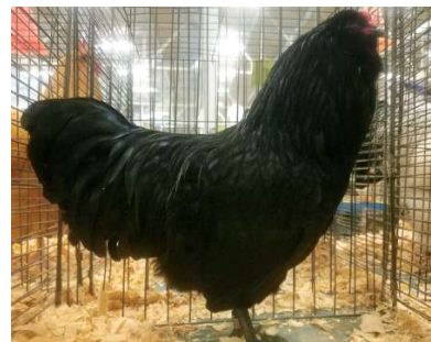
Daniel Cook's Reserve Champion AOSB Black Cockerel at Kansas Mini Mega Poultry Show, November 27, 2021.

Please request meets as early as possible. If there are multiple shows at the event such as a double show, please make a meet request for each show at the event.